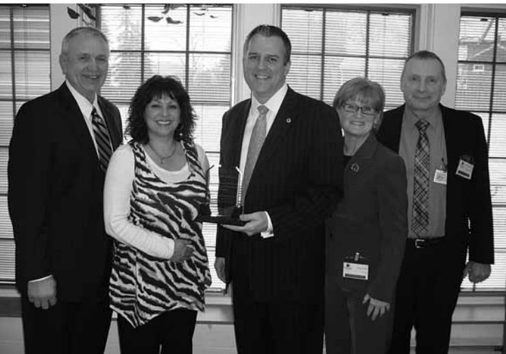
Shaler School District is honored at the School District Appreciation Breakfast