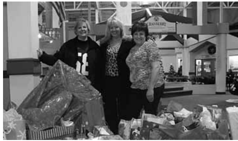
THE CHAMBER of Commerce, Inc. was one of many groups providing holiday joy.

our care, their gifts meant more than a brightly wrapped box. The real present was the knowledge that they were in someone's thoughts during the holiday season. Thank you again to everyone who contributed to this year's gift drive. Your generosity added smiles to many faces- children and staff alike.