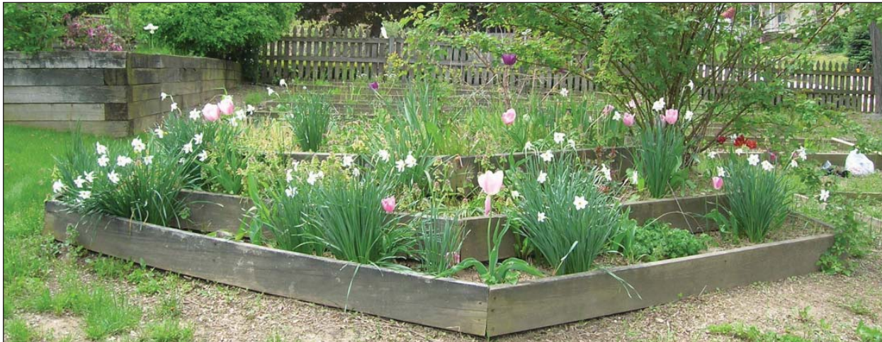
A Community Service Learning Project. Students in one of our therapeutic classrooms help maintain the school flower garden.